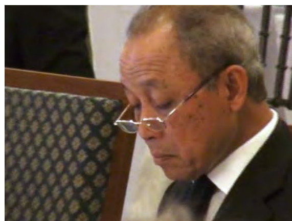
▲ Chief Justice Rt. Hon. Tun Arifin bin Zakaria of the Federal Court of Malaysia

Chief Justice Tun Arifin bin Zakaria, chief justice of the Federal Court of Malaysia, reported that the Malaysian judiciary had already implemented most of the action items under the Jakarta Common Vision and the Hanoi Action Plan. First, through Practice Direction No. 3 of 2012, it established green courts and shortened the time for disposing environmental cases to 6 months from the time they were registered with the courts. So far, about 90% of the environmental cases filed since the directive was issued have been settled within this time frame. Also, about 42 sessions courts and 53 magistrates' courts throughout Malaysia have been