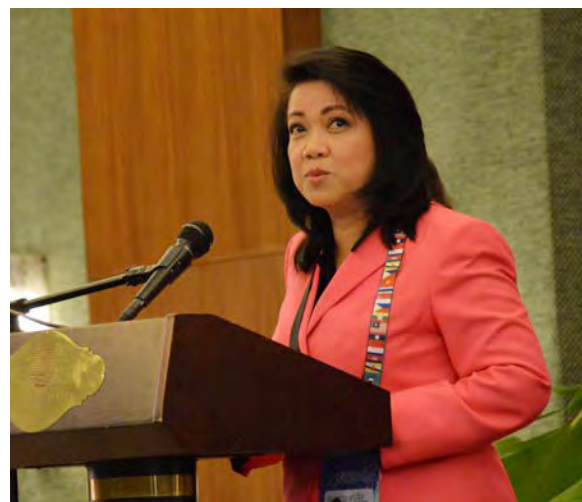
▲ Supreme Court of the Philippines Chief Justice Maria Lourdes P. A. Sereno presents her opening remarks