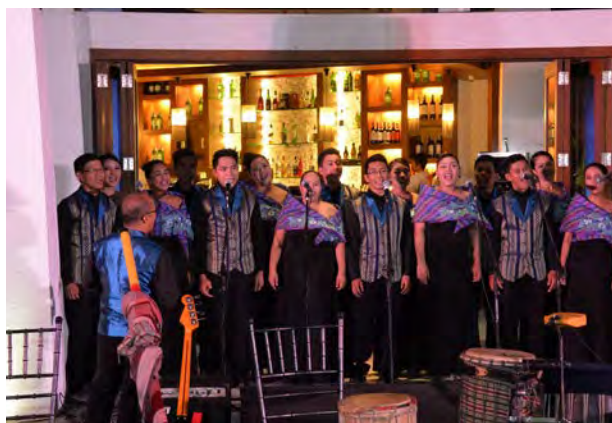
▲ Puerto Princesa City Chorale