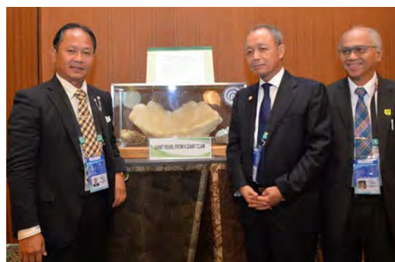
▲ ASEAN delegates take a photo with the largest pearl in the world