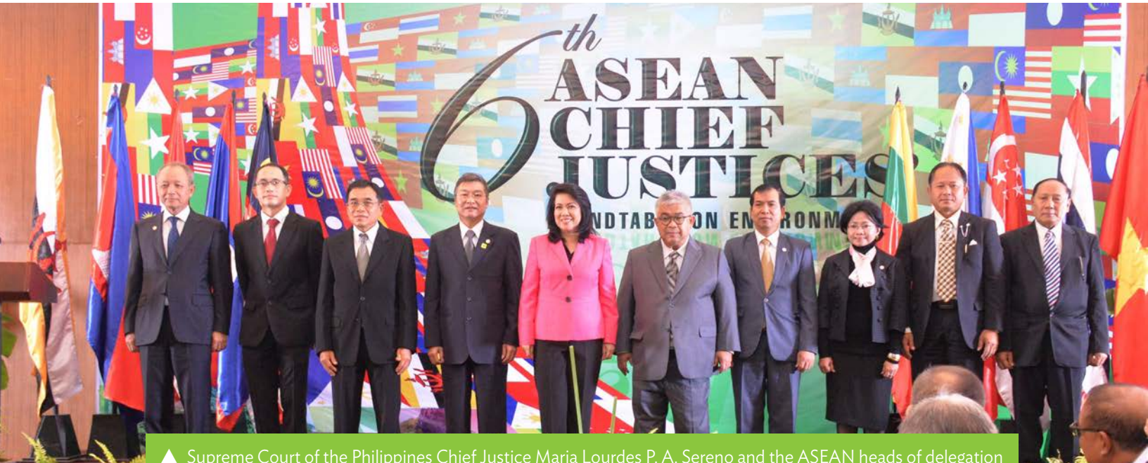
▲ Supreme Court of the Philippines Chief Justice Maria Lourdes P. A. Sereno and the ASEAN heads of delegation