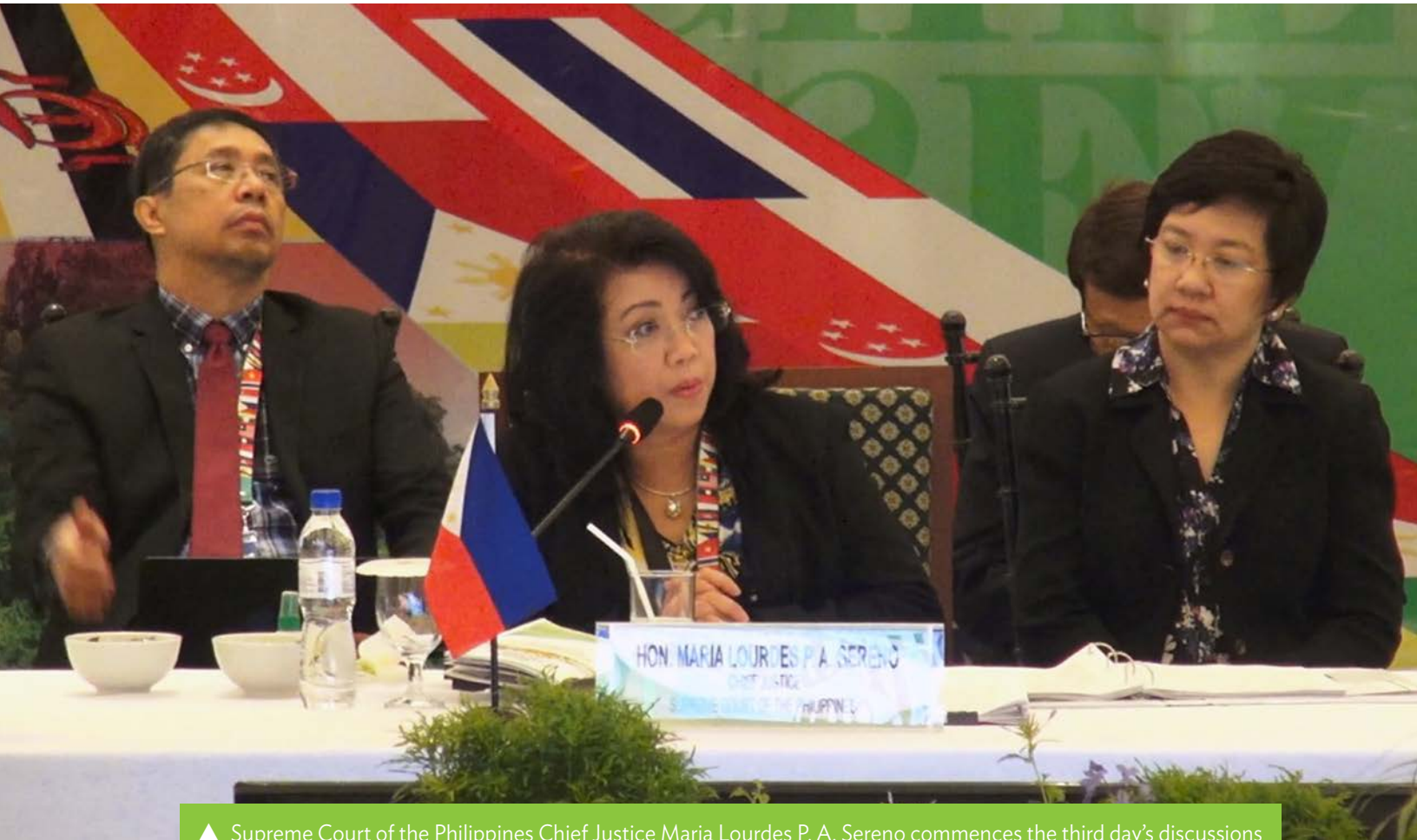
▲ Supreme Court of the Philippines Chief Justice Maria Lourdes P. A. Sereno commences the third day's discussions