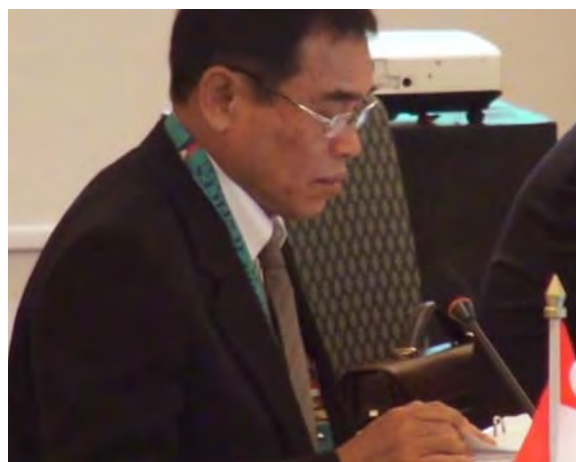
▲ Justice Slaikate Wattanapan of the Tax Division of the Supreme Court of Thailand

Justice Slaikate Wattanapan, president of the Tax Division of the Supreme Court of Thailand, said that the Thailand judiciary has not yet established its official national judicial working group on environment. The courts of justice, however, have assigned their environmental division to fulfill their environmental commitments to ADB, the World Bank, and other ASEAN countries. He explained that Thailand has a dual court system, comprising the courts of justice and the administrative courts. Both courts handle civil cases, but only the courts of justice deal with criminal cases. The administrative courts hear and decide administrative cases.