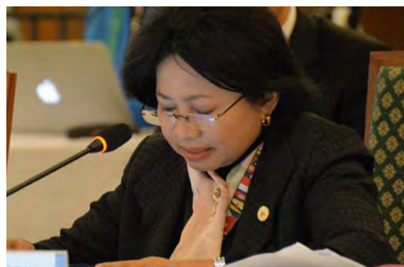
▲ Vice Chief Judge Andriani Nurdin of the Surabaya High Court

At the time of the Sixth Roundtable, approximately 1,000 Indonesian judges had already received such training. The Indonesian judiciary believes that the continuous environmental law training of judges is needed to ensure fair trials, strengthen enforcement, deter environmental violations, and encourage compliance. For instance, after the forest fire crisis in 2015, the Supreme Court of Indonesia worked