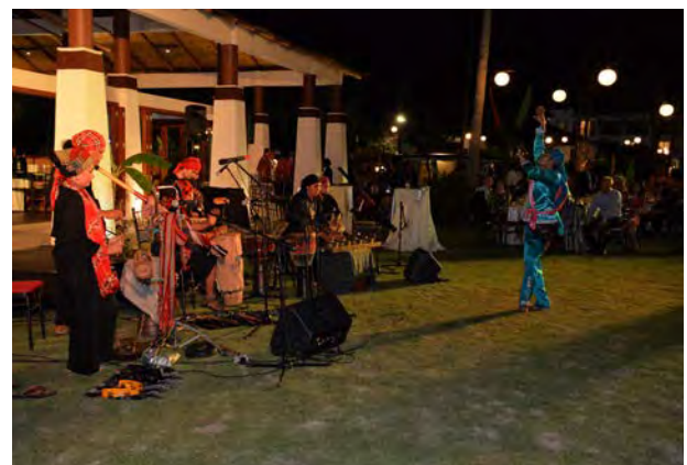
▲ Kawangis ng Tribu