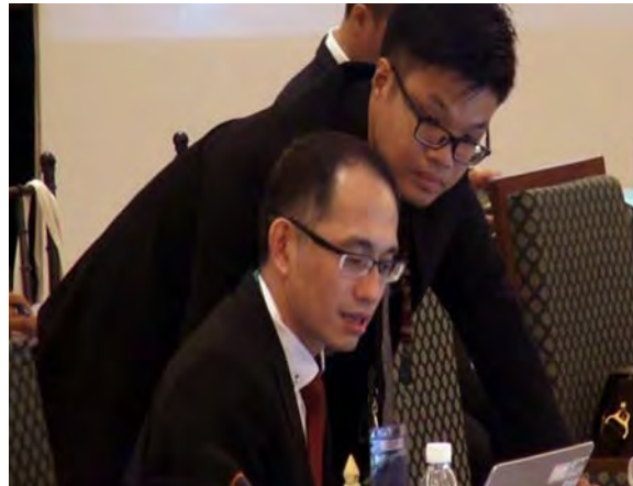
▲ District Judge Luke Tan of the State Courts of Singapore

District Judge Luke Tan of the State Courts of Singapore thanked the Supreme Court of the Philippines for cohosting this roundtable. He said that Singapore supports the ASEAN judiciaries' efforts to protect the environment and recognizes the relevance of the work of the ASEAN Chief Justices' Roundtable on Environment to many ASEAN countries. As a small city-state with a highly urbanized landscape, Singapore faces unique challenges that are not common to other ASEAN countries. Singapore courts do not hear many environmental cases and have no special procedural rules for environmental cases. He also noted that the Jakarta Common Vision, the Hanoi Action Plan, and the Angkor Statement are aspirational and nonbinding documents.