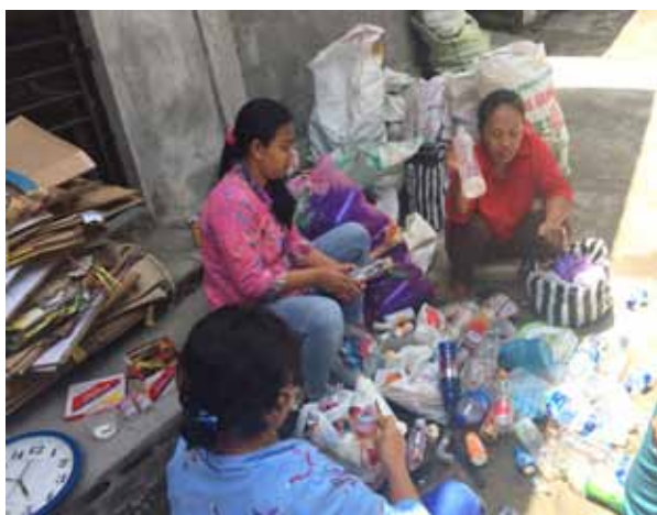
Community leaders participate at a learning exchange on waste management in Yogyakarta, Indonesia (photo by ADB).

Through ADB's Integrated Disaster Risk Management Fund, the Huairou Commission partnered with NGOs in Indonesia and the Philippines to drive community disaster resilience activities in poor and vulnerable communities. The commission worked with the Indonesian NGO, YAKKUM Emergency Unit; and DAMPA, a federation of women-led community-based organizations in the Philippines. By mobilizing grassroots women's groups, the project empowered women living in disaster-prone communities to lead innovative disaster risk management activities. The Huairou Commission is a network that builds the capacity of grassroots women's organizations to promote sustainable, gender-equitable and pro-poor development.