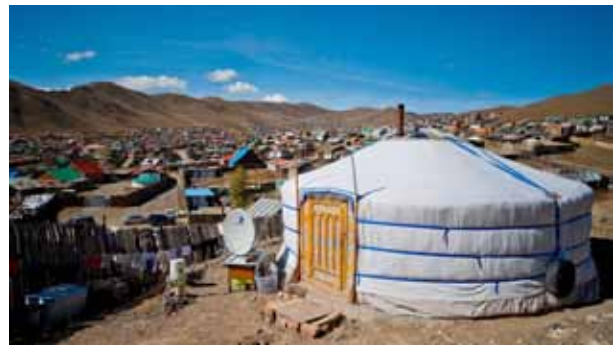
The project promotes equal participation for people with disabilities in economic and social activities by making it easier for them to access basic services and job opportunities.

In 2017, ADB approved a $25 million loan to help improve the quality of life of people with disabilities in Mongolia, by providing better economic and educational opportunities, and enhanced public service access and delivery. The project covers Ulaanbaatar and six provinces, and will focus on early identification of children with disabilities through early medical and social intervention. It will also improve the service delivery for people with disabilities by engaging social workers, conducting family sessions, and establishing a dedicated hotline on information, counseling, and referrals. 17