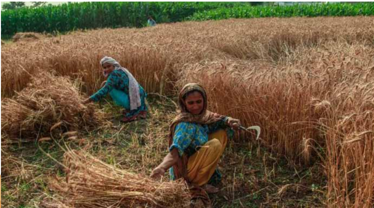
The surface irrigation system will help increase agricultural production and improve food security in the Jhelum and Khushab districts in Punjab province, Pakistan.

In 2017, ADB approved a $275 million loan to help build a surface irrigation system to increase agricultural production and improve food security in the Jhelum and Khushab districts in Punjab province in Pakistan. During project design, meetings and consultations were held with various stakeholders including CSOs, where discussions about the objectives and location of the project were undertaken.