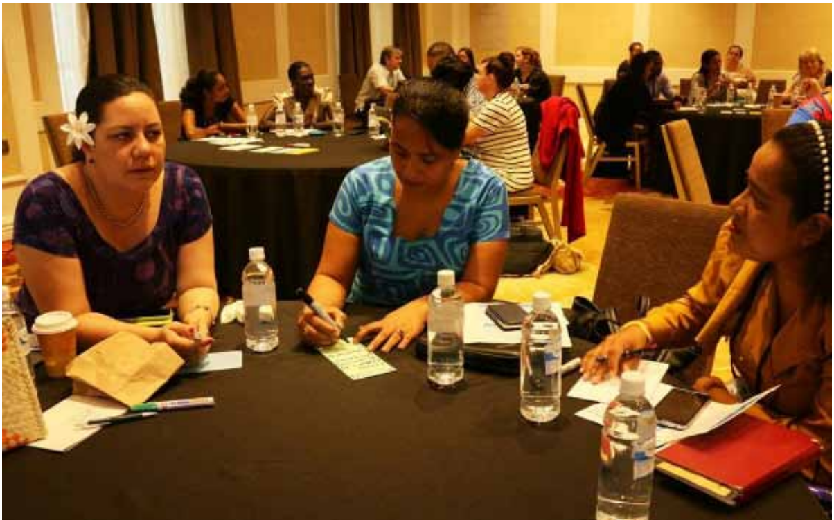
Workshop participants from governments, CSOs, and ADB participated in a training to deepen CSO engagement in ADB's operations on 11–13 September 2017 in Apia, Samoa.

The training focused on how ADB, together with governments, can work more effectively with CSOs in the various phases of the project cycle, and in the context of ADB's business processes. Participants developed specific recommendations on deepening ADB–government–CSO cooperation in the Pacific. The learning event was organized with support from the ADB Institute.