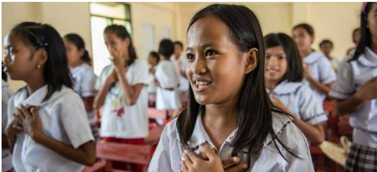
Bislig Elementary School in Leyte, Philippines was badly damaged by Typhoon Haiyan, but rehabilitated through ADB's support.

ADB signed the first MOU with Plan International in 2013 and, since then, the collaboration has focused on supporting greater inclusion and engagement of youth in ADB's activities and operations. A new MOU was approved in March 2017, that formalizes joint initiatives in poverty reduction and inclusive economic growth, environment and climate change, and gender mainstreaming, among others. The agreement led to Plan International producing a research paper on economic migration of young women in Asia. In addition, Plan International prepared a study for ADB on the contribution of youth in the achievement of the Sustainable Development Goals. It has also been supporting ADB in rebuilding livelihood activities of communities affected by Typhoon Haiyan in the Philippines. In Cambodia, it helped build the capacity of local CSOs by working with local communities to build climate change resilience in young people within the core of a climate change adaptation project.