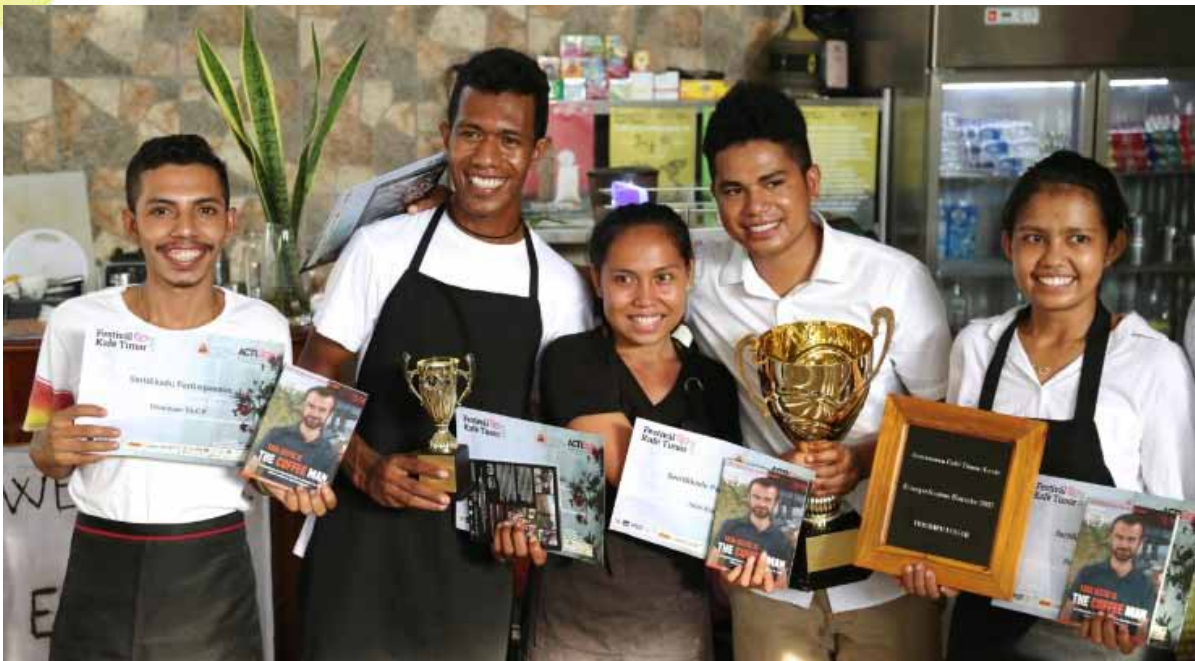
Winners in the barista competition in 2017.

ADB's support will continue in 2018 with an awareness campaign to attract the youth to the coffee industry through an innovative reality TV show called "Fila fali ba to'os" or "Back to the farm." The show will pair young baristas working in Dili with coffee farming groups throughout the country. The barista and farmer teams will work to improve the quality of their coffee by implementing quality improvement initiatives. These initiatives will be showcased on the TV show, and culminate in a coffee quality and barista competition at Festival Kafe Timor 2018.