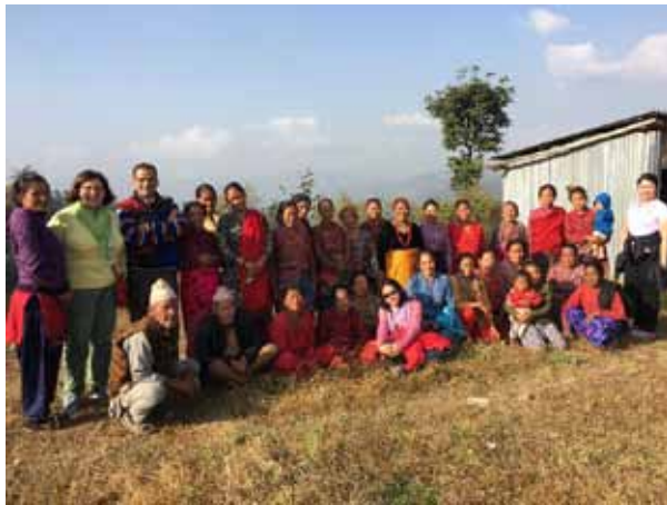
A team from ADB's South Asia Department is visiting the Citizen Awareness Center in Mahendrajyoti village in Nepal and interacting with members of the Citizen Ward Forum to hear their experiences as beneficiaries of the Strengthening Public Management Program.

ADB's Strengthening Public Management Program has made significant strides and is potentially transformative in supporting the Government of Nepal's decentralization reforms. A system of streamlined disbursement of central government grants was implemented through (i) use of gender empowerment and social inclusion indicators; (ii) earmarked funds for disadvantaged groups, women, and children; and (iii) participatory planning for small community grants through ward citizen forums (WCFs) and citizen awareness centers (CACs). These measures have had significant institutional impact in improving allocative efficiency of resources by the local bodies, and meeting performance benchmarks on socioeconomic targets.