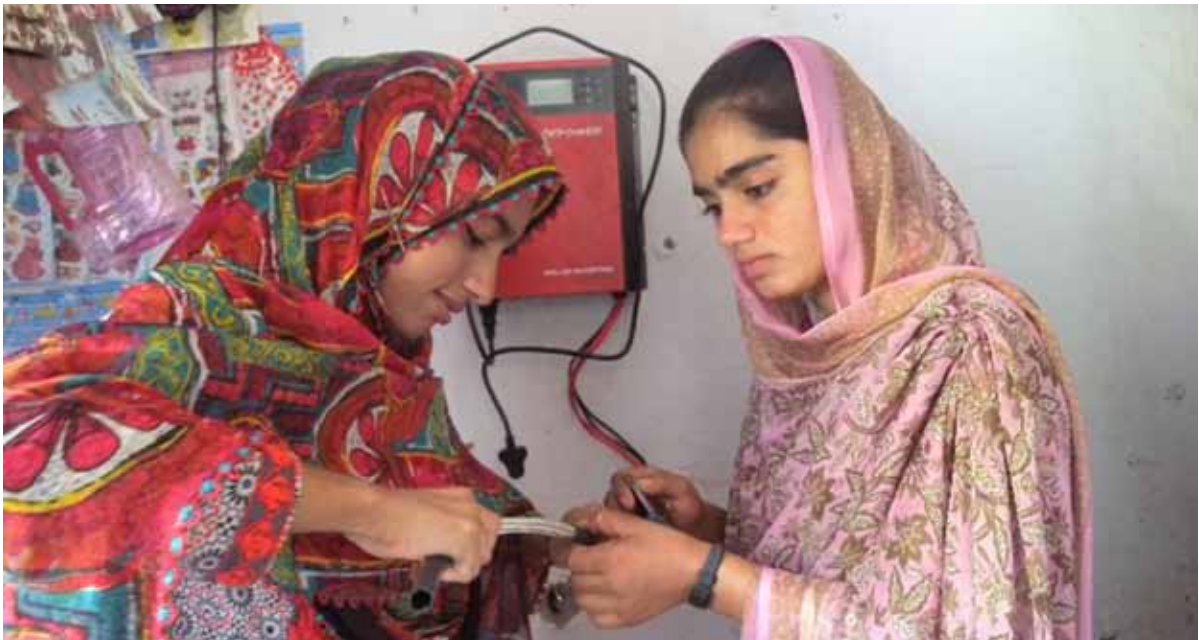
Women learn to be solar technicians and entrepreneurs.

ADB supported ACTED Pakistan in training women in Multan, Punjab to be solar technicians and entrepreneurs. Multan village faces severe energy shortages, with no access to electricity for up to 20 hours per day. Solar energy is a growing subsector in Pakistan, but there is a lack of trained technicians. Moreover, women are hindered from taking advantage of new opportunities related to solar energy because the energy industry is still traditionally male-dominated.