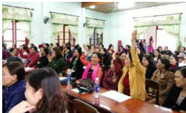
Awareness-raising workshop were carried out on the roles of market management committees and market vendor's associations.

As part of ADB's Greater Mekong Subregion (GMS) Corridor Towns Development Support, the regional GMS Livelihood Support for Corridor Towns grant project aims to (i) enhance poverty reduction impact of ADB's economic corridor towns development strategy, and (ii) increase capture of economic benefits to poor, informal traders. The project provides market facilities; microfinance support; and skills development in financial management, product development, and business plan development to eligible poor informal vendors in Cambodia, the Lao PDR, and Viet Nam.