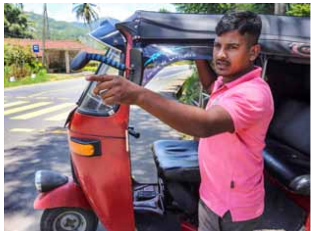
Photo shows a three-wheeler driver in Sri Lanka. ADB operations in Sri Lanka adjust to align with the evolving needs of the country, which is reaching upper-middle income status (photo by ADB).

During project design, 20 consultations and social surveys were conducted with relevant community-based organizations through household surveys, group discussions, and a transect walk. Participatory approaches were undertaken to increase stakeholder awareness of the project, determine people's needs and concerns, and obtain suggestions for enhancing benefits and mitigating negative impacts. Community engagement is expected to provide impact to road designs, especially for improving road safety, minimizing environmental impact, and minimizing construction impact.