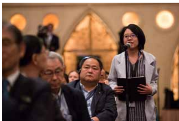
Each year the ADB organizes a Civil Society Program as an integral part of the Annual Meeting.

The Civil Society Program of the ADB Annual Meeting provides a venue for sharing lessons about good practice and innovation in poverty reduction. 12 The program also offers opportunities for networking among CSOs and other development partners on key development topics. Oxfam’s session, “Addressing Rising Income and Wealth Inequality in Asia: Reflections for Strategy 2030 from Civil Society,” highlighted the need for development organizations such as ADB to combat inequality and develop concrete indicators to measure inclusive growth. The panel on “Advancing Women’s Leadership in the Coral Triangle” presented inspiring examples of women leaders working together to improve marine and coastal management in the Coral