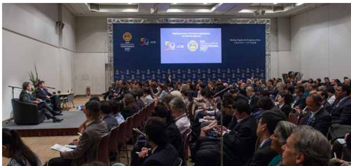
ADB President Takehiko Nakao meets with civil society representatives during ADB's 50th Annual Meeting.