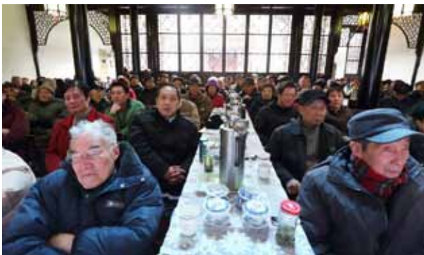
The aging population—and its attendant social and economic impacts—is the most significant demographic challenge facing the PRC.

The aging population—and its attendant social and economic impacts—is the most significant demographic challenge facing the People's Republic of China (PRC). The Hebei Province reached "aging society" status in 1999 when it passed the 10% threshold of population over the age of 60. Traditional family support systems are increasingly unable to meet elderly care needs, due to the combined impacts of fast urbanization, internal migration of youth away from rural areas, and the one-child policy.