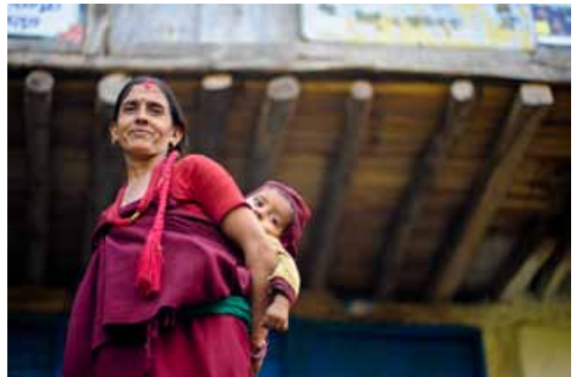
ADB's Accountability Mechanism provides a forum where people adversely affected by ADB-assisted projects can voice and seek solutions to their problems and report alleged noncompliance with ADB's operational policies and procedures.

In 2017, ADB had a series of outreach sessions with CSOs and discussed its accountability mechanism in key areas in Myanmar, Sri Lanka, Thailand, the United States, and Uzbekistan. The sessions highlighted the accountability mechanism process, procedures, issues faced, and role of CSOs related to its implementation. The meetings also emphasized the need to improve remedial actions for people affected by ADB projects, and lessons from previous cases that went through the accountability mechanism processes. Additionally, workshops on the development of guidebooks on compliance review were held in ADB headquarters, Azerbaijan, Bangladesh, and Georgia where NGO participants had the opportunity to comment on the knowledge product being developed under TA 9289. 11