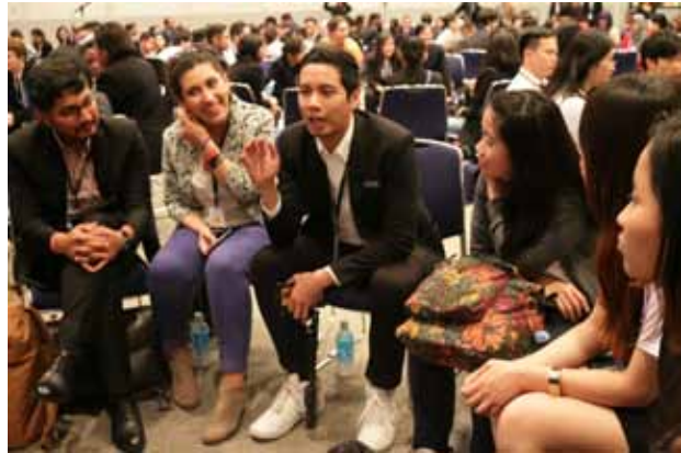
Effective youth engagement brings fresh ideas and perspectives to ADB's operations.

The 5th Asian Youth Forum was held on 2–7 May 2017 in Yokohama, Japan as a back-to-back event to the 50th ADB Annual Meeting. Co-hosted by another NGO, Plan International, the forum provided the venue for improving the capacity of youth to understand ADB's operations and to contribute innovative and effective solutions to support future and ongoing projects. The event assembled over 180 youth from over 30 ADB member countries. It was organized in cooperation with other NGOs such as the ASEAN Youth Leaders Organization, World Vision, and YouthThink Center. 8