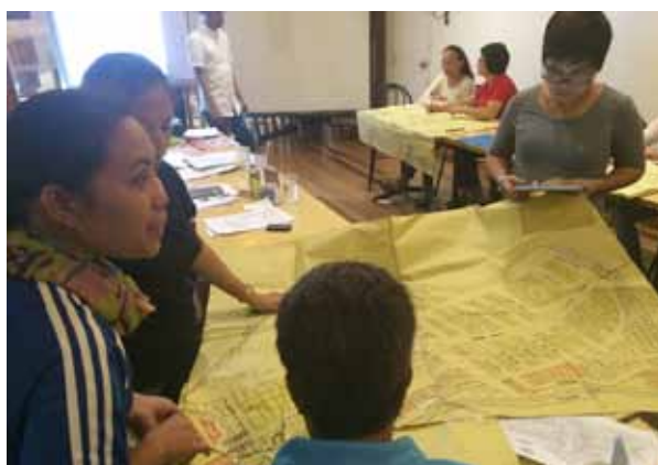
Members of DAMPA discuss priorities for action during a workshop in Manila (photo by ADB).

In the Philippines, DAMPA put into action a similar program in five barangays in Metro Manila, and in another five barangays in Tanauan, Leyte, which were badly affected by Typhoon Haiyan in 2013. Community disaster risk maps formed the basis for setting resilience activities and advocating for support from local government authorities. In Metro Manila, women's groups successfully negotiated for municipal investments to upgrade infrastructure and carry out waste management activities to improve sanitation and reduce flood risks in informal settlements. In Leyte, on the other hand, the women were able to get support from local government institutions to access resources for livelihood activities. In both project areas, grassroots organizations successfully collaborated with government agencies to identify beneficiaries for social protection programs.