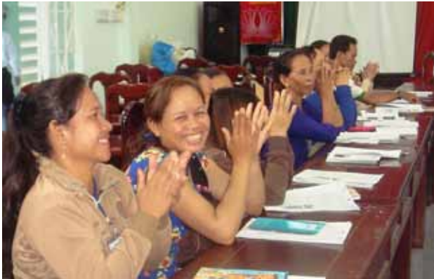
Members of the Women's Resilience Network attend the Participatory Action-Oriented Training Approach in Co Do District, Can Tho City, Viet Nam.

Through the Integrated Disaster Risk Management Fund, ADB extended direct assistance to local governments and CSOs to carry out community-based and gender-focused disaster risk management in Southeast Asian countries. Pilot projects which demonstrate innovative solutions to strengthen disaster resilience were implemented in Indonesia, the Philippines, and Viet Nam.