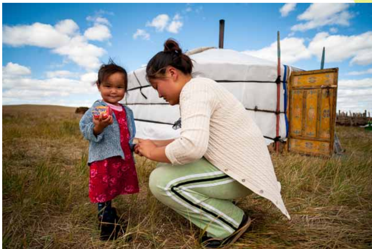
ADB has been Mongolia's largest multilateral development partner since 1991, playing a central role in the country's transformation to a middle-income, market-based economy.