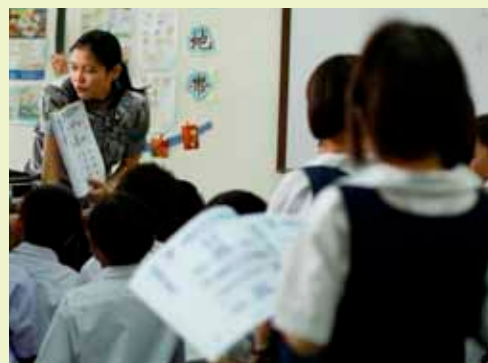
▲ Malaysia's textbook policy is highly centralized with little autonomy for schools. Photo shows a primary school in Johor Bahru.

Statements by the World Bank and the Organisation for Economic Co-operation and Development concur with the above: “Most countries whose students perform well on international tests accordingly confer substantial autonomy to local authorities and schools.” b