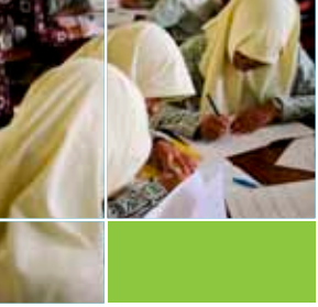
Singapore's textbooks particularly for math have become widely used in many countries. Photo shows Singaporean students solving a math problem.