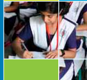
Textbook policies influence learning outcomes. Students attend class in a coeducation system at the Engineering University School and College in Dhaka.