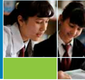
Textbook content (text and illustrations) should consider social and ethnic balance as well as inclusion.