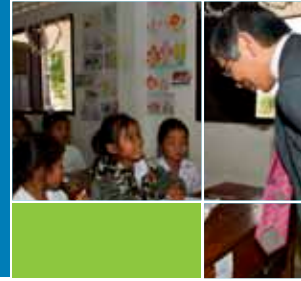
The continuing need for high-quality textbooks and digital learning tools and systems calls for more intensive efforts and investment. Photo shows President Kuroda visiting a village in the Lao People's Democratic Republic.

Official textbook policy documents may be general or highly specific, the latter covering of all aspects of the textbook chain—from definitions of textbook quality to guidelines for the storage and reuse of textbooks in schools. (For examples of detailed policies see Education Bureau, Hong Kong, China. n.d.; Ministry of Education, Republic of Korea 2015.) In higher-performing educational systems, textbook policies regulate the relationship between publishers and stakeholders in an often complex system. In lower-income countries they also act as a framework for support by development partners. Policy statements by highly centralized textbook publishing systems, such as the countries of the Indian subcontinent where governments see less need to define the roles of their own personnel, are usually very short and form only a part of general educational policy statements.