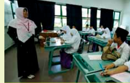
▲ In Singapore, the Ministry of Education publishes textbooks for languages (Chinese, Malay, or Tamil). Photo shows students of Madrasah Wak Tanjong learning basic Arabic language skills.

In 2015, the ROK announced that in the future it would publish the post-primary history textbooks itself, in order “to establish a correct and balanced historical perspective based on objective facts and faithful to constitutional values.” a Following public protests, the MOE relented and decided to publish its textbook alongside other commercial textbooks. Few schools opted for the government’s history textbooks. b