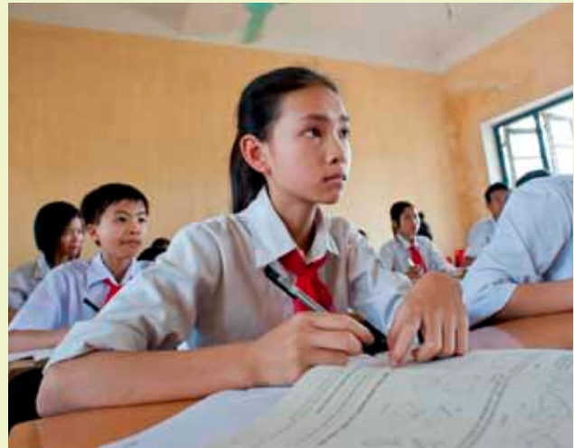
▲ Textbook policy inevitably reflects political environments. However, there is no natural link between political systems that describe themselves as liberal, and textbook policies that can be described as liberalized.

In Taipei, China , the Reviewing Committee offers suggestions for revisions to the publishers, who might revise their textbooks or seek to justify their decisions. There may be two or three review cycles.