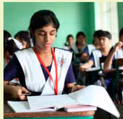
▲ South Asia has one of the most centralized textbook systems in Asia and the Pacific. Students attend class in a coeducation system in Dhaka.