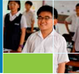
Teacher's resources and other learning materials may be necessary for some subjects, especially for the mother tongue.

Photo shows students in the Thai Hong Primary School in Johor Bahru who study the Malay language as one of their subjects.